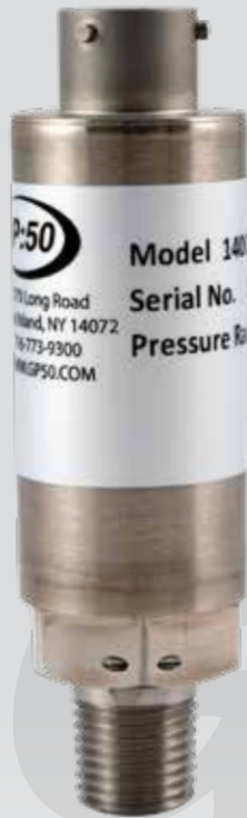
Model 140/240/340 Compact Industrial Pressure Transducer